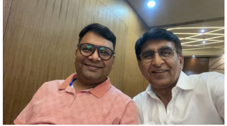
Attended the 3rd Presidents, Secretaries, AG and ZS Meet on 25th April 2026 at Haldiram Banquets.