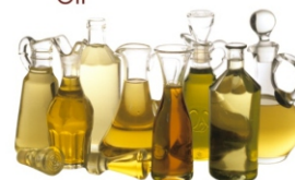
OTHER ALLIED PRODUCTS